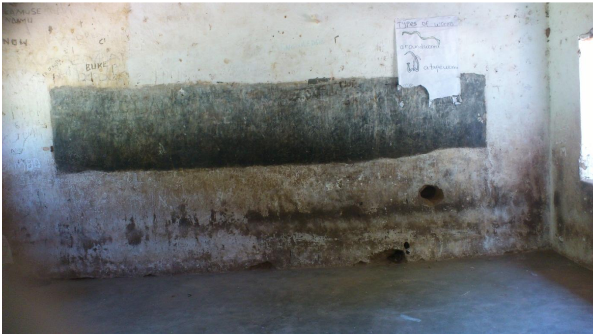
Plate 16: Blackboards in very poor condition