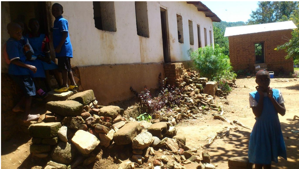
Plate 7: Sight of very Unsafe Entrance Areas