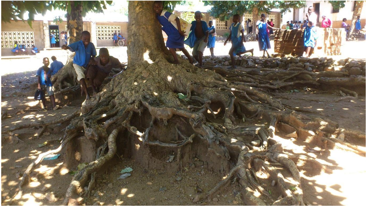
Plates 19: Poor State of Outside School Grounds