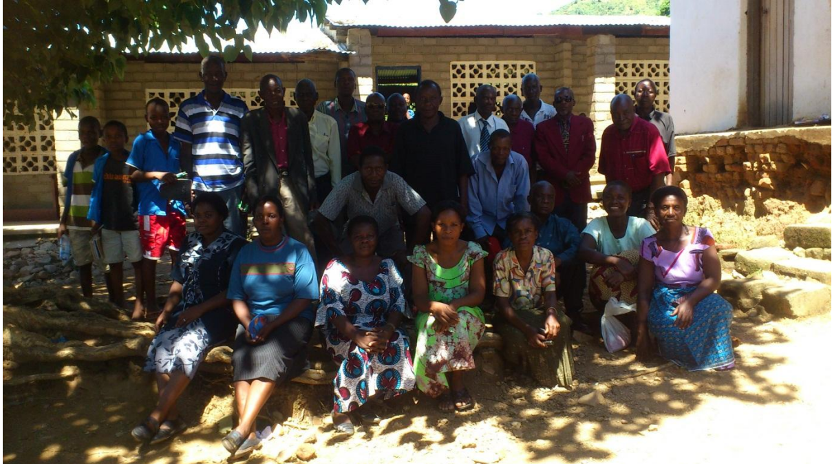
Plate 4: Some of the Participants (of course Mlowe kids being who they are, they have to get in on the act)