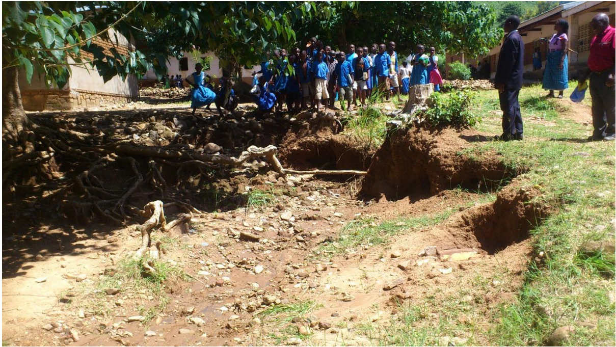
Plates 21: Poor State of Outside School Grounds