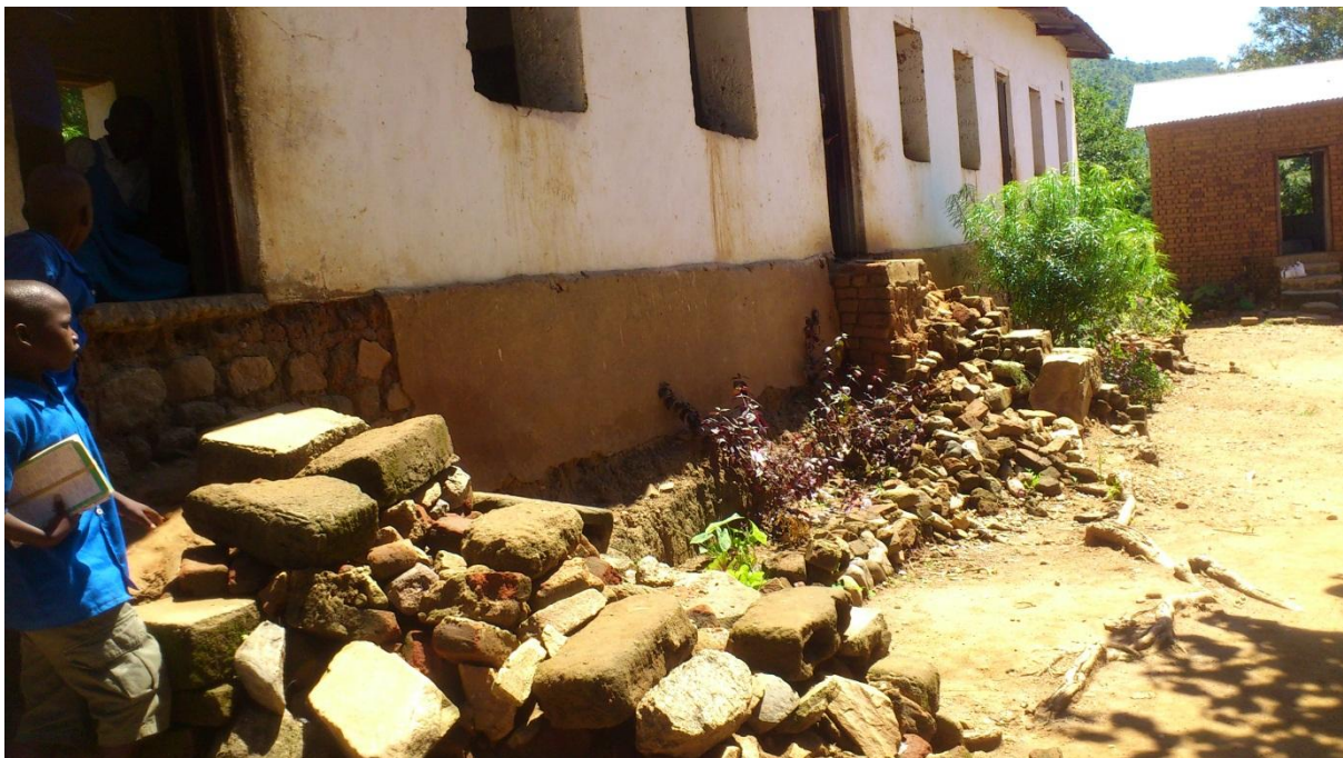
Plate 5: Sight of very Unsafe Entrance Areas