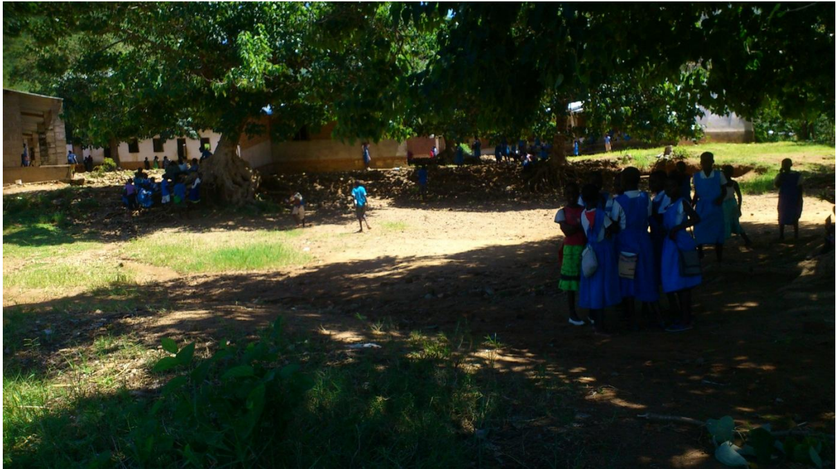
Plates 22: Poor State of Outside School Grounds