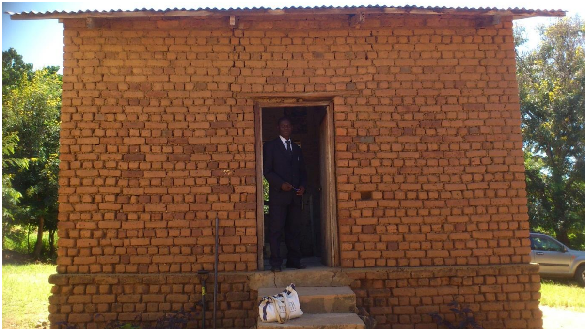
Plate 23: State of Headmaster's Office