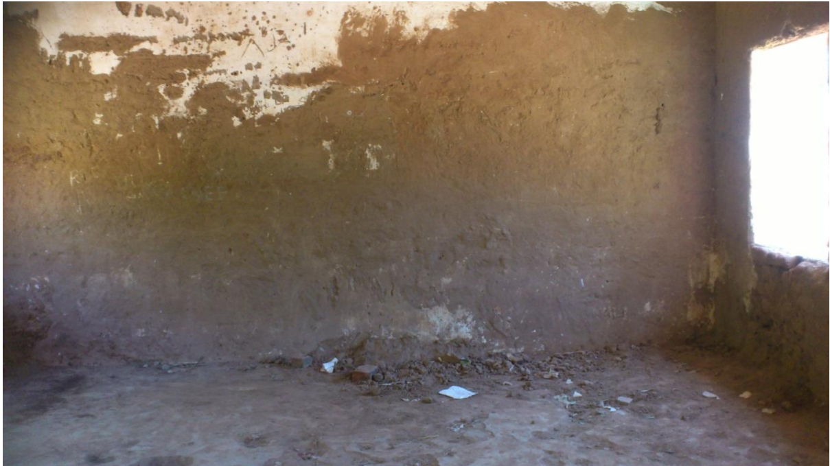
Plate 13.: State of Classrooms in very bad condition